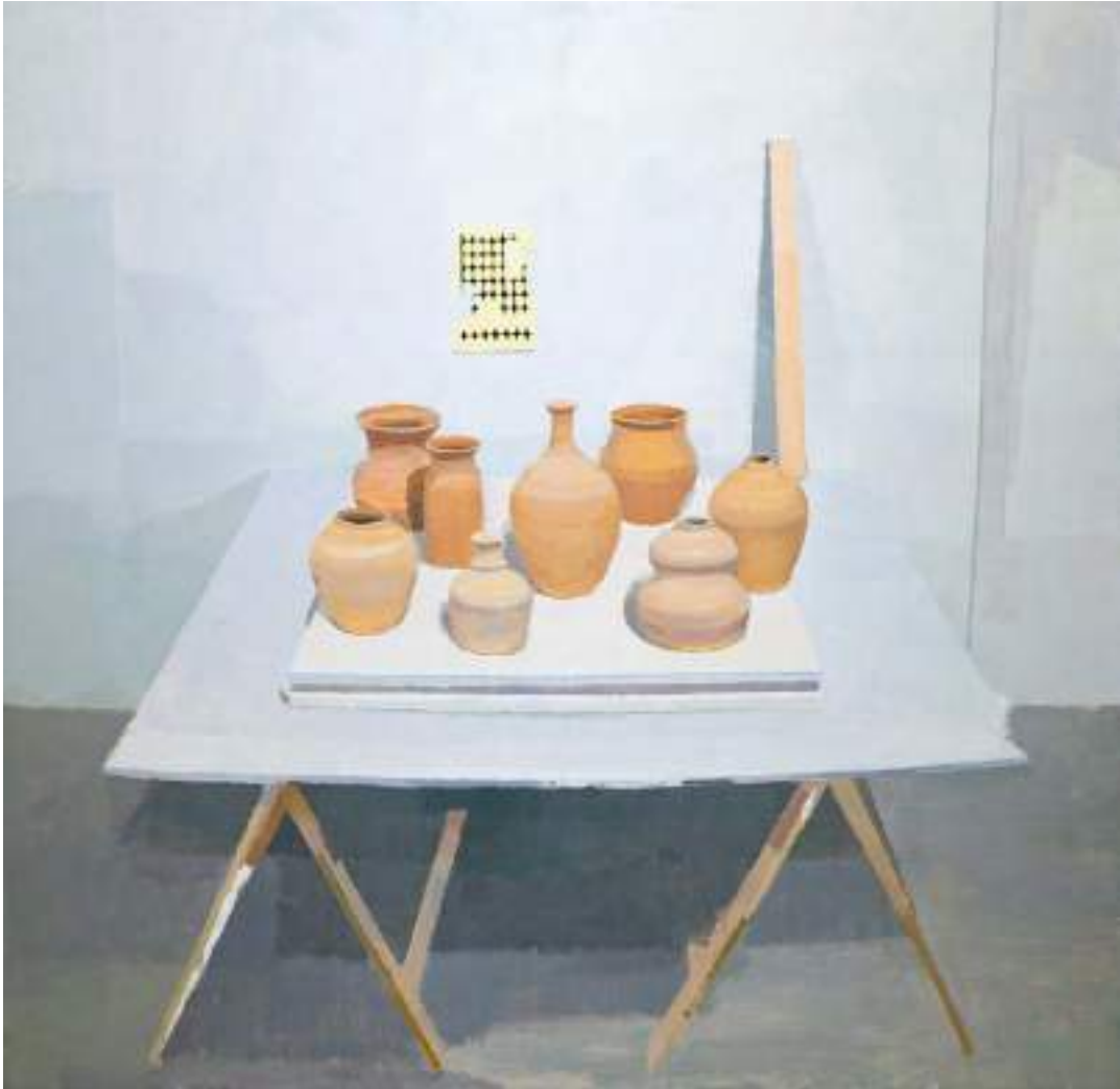
Estudio II, en Bilbao