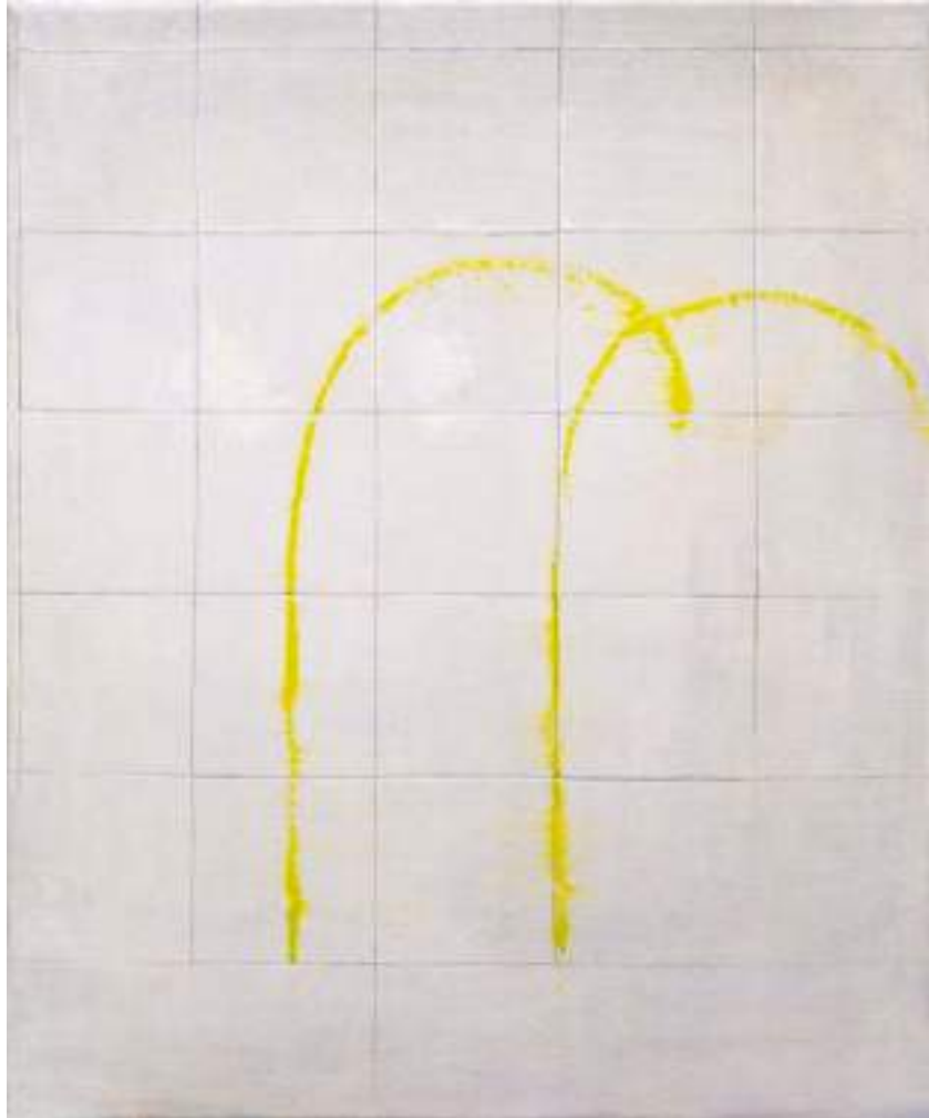
Construcción II 73 x 60 cm, oil on canvas, 2021