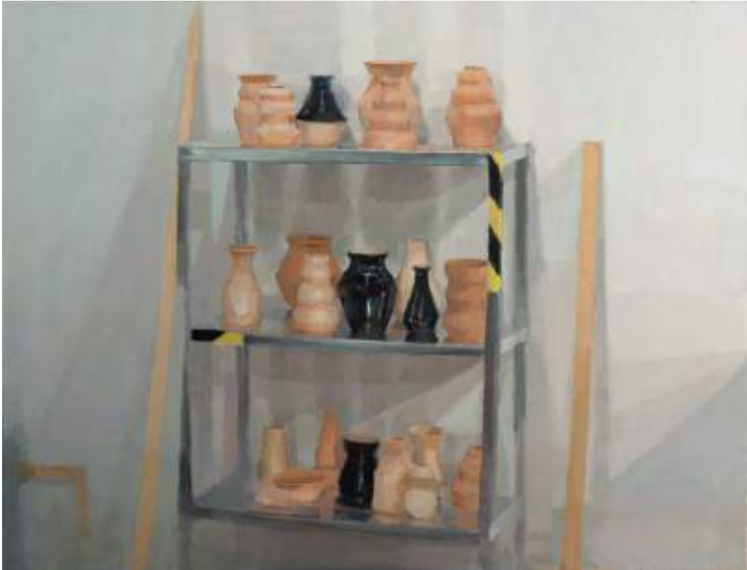
In my studio, en Bilbao