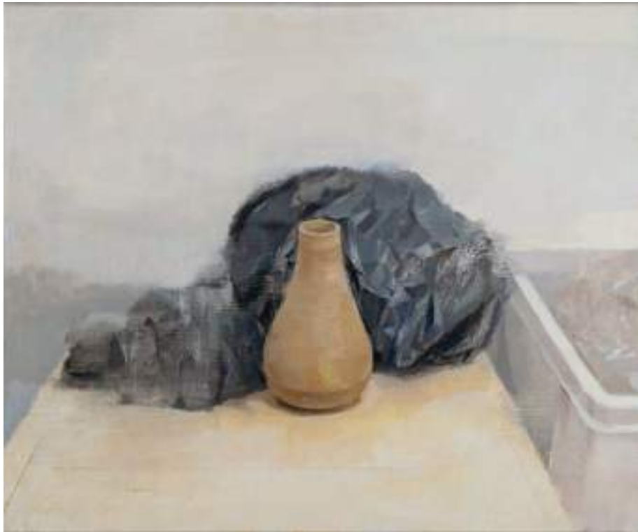
Partes del proceso I 54 x 65 cm, oil on canvas, 2020