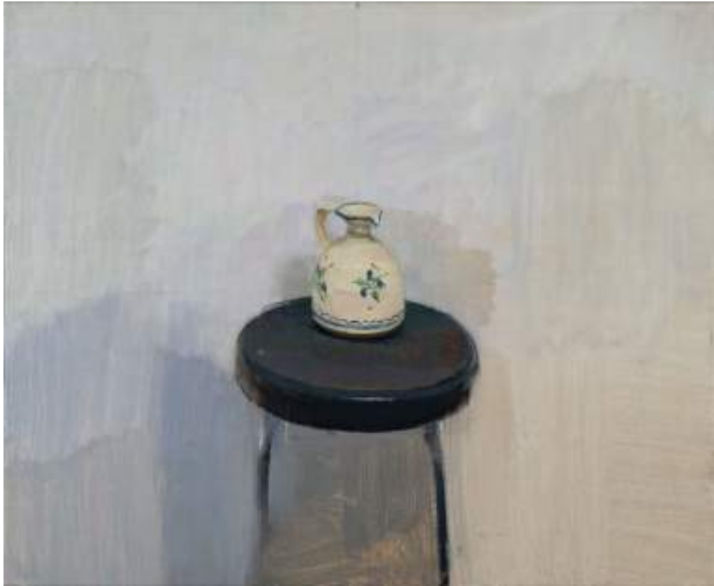
Sobre bailen I 60 x 73 cm, oil on canvas, 2021