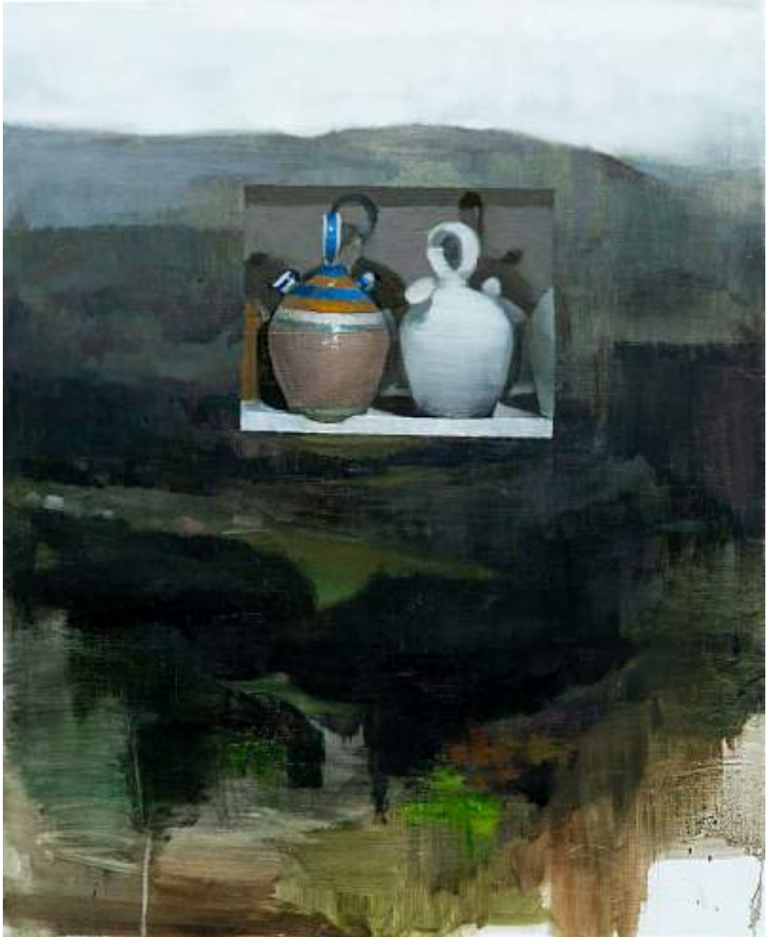
Sobre el paisaje en el paisaje 172 x 130 cm, oil on canvas, 2019