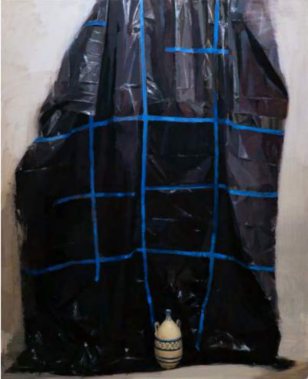
Proceso II, de la série Sobre la Resistencia