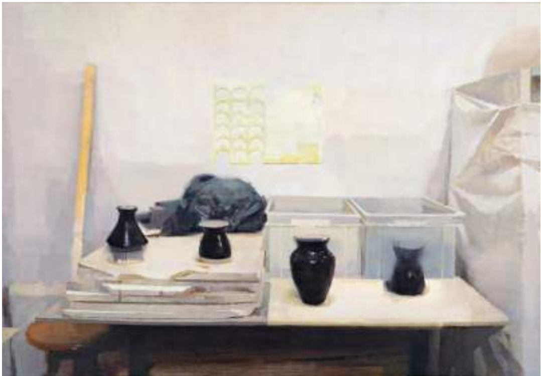
Estudio I, en el proyecto HEMEN, Bilbao